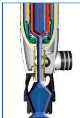
The backwash operation